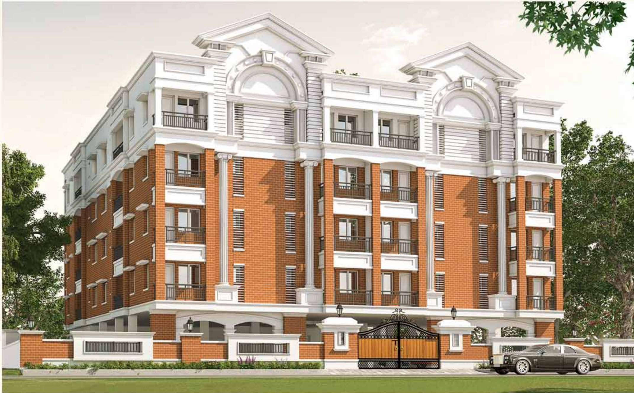
GOLDEN HOMESTEAD - HARRINGTON ROAD